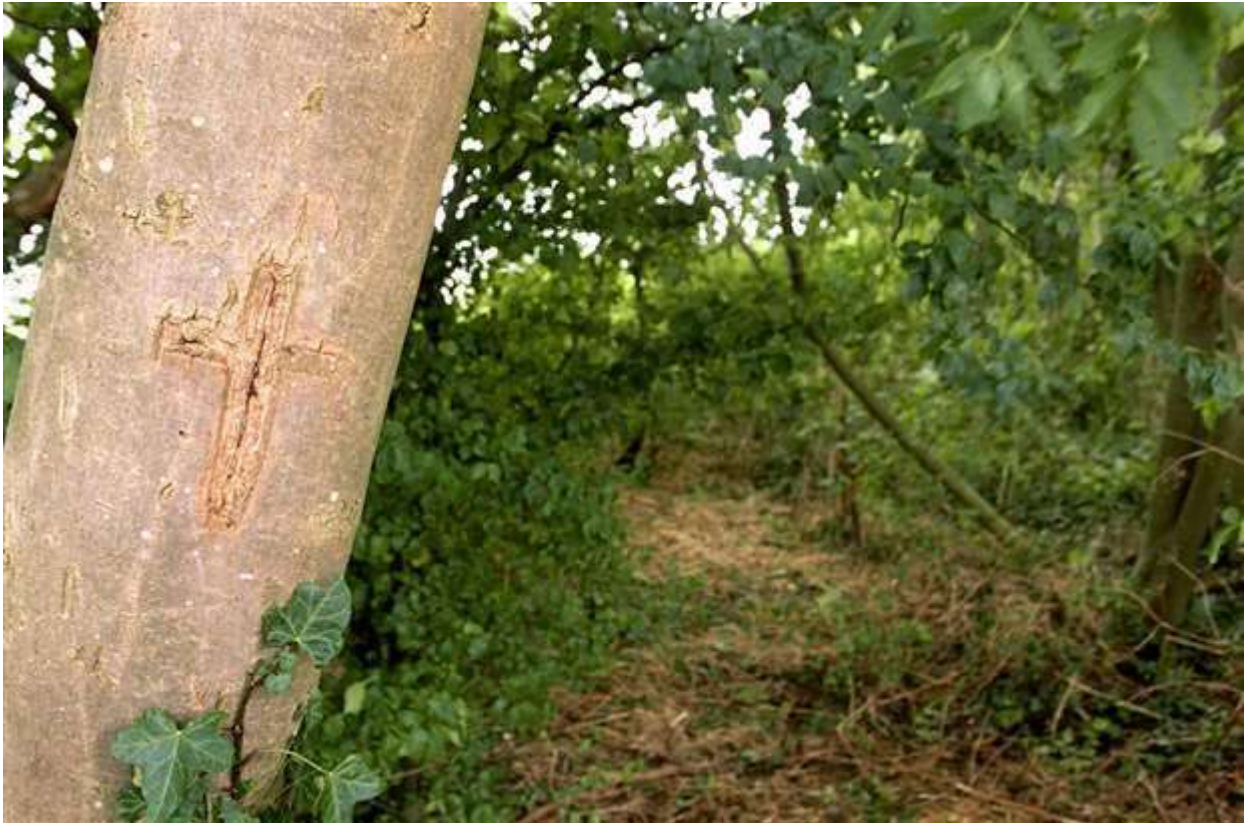
A cross carved into a tree near the scene of the killings